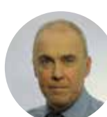
MALCOLM YOUNGSON CEO, The Interna- tional Federation of Purchasing and Supply Management